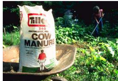
Figure 5. Many home gardeners like to use cow manure to enrich their soil.

too bulky for farmers to buy, but gardeners often seek them to enrich their soil (Figure 5). Many gardeners are eager to buy or take manure from local farms.