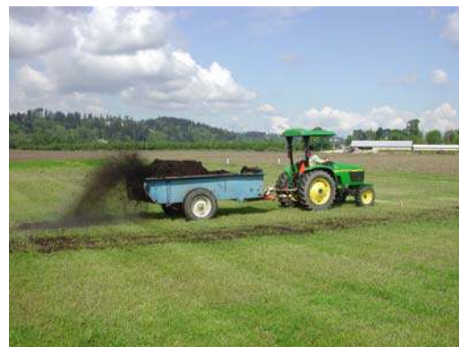
Figure 3. Calibrate your manure spreader so you have a good idea of how much manure you are applying.

idea of how much manure you are applying. The principle of calibrating a manure spreader is the same as calibrating a fertilizer spreader, a planter, or a sprayer. The simplest method is to spread tarps on the ground and weigh the amount of manure that falls on each tarp as the spreader passes over it. If you have access to truck scales, you can weigh a full spreader, apply a load to your field, weigh the spreader again, and measure how much land you covered (Figure 3). You can also estimate volume spread by calculating the volume of your spreader. For details and simple worksheets on calibration, see “Fertilizing with Manure,” available from Washington State University Extension.