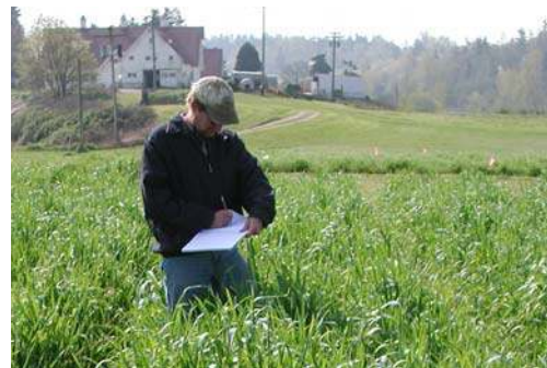
Figure 4. A rye cover crop protects a field fertilized with manure.

A fall-planted cover crop such as rye protects the soil and prevents manure runoff during the winter.