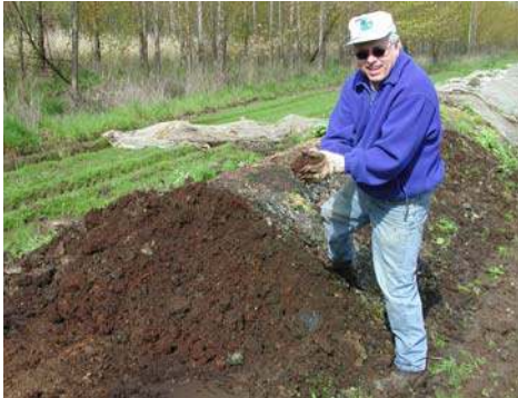
Figure 6. Well-composted manure is dark and crumbly.

a fertilizer and horse manure as a mulch or soil amendment.