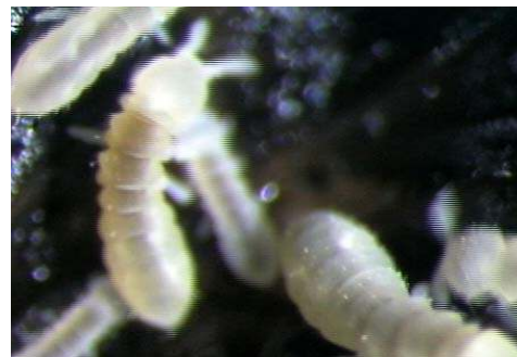
Figure 1. Tiny soil organisms that help break down organic matter.

Fresh manure breaks down faster than composted manure. Poultry manure breaks down faster than manure from horses, cattle, goats, and other animals. In general, the more nitrogen that manure contains the quicker the nitrogen is released.